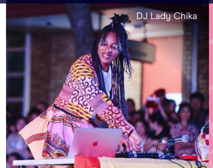
DJ Lady Chika