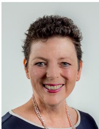
Cr Lesley Furneaux-Cook Deputy Mayor

A well connected, innovative, sustainable and safe community that embraces and celebrates its diversity